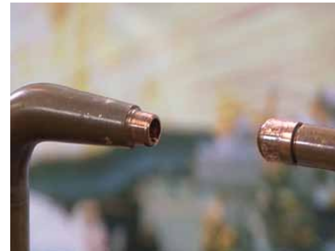
WRA250 in use