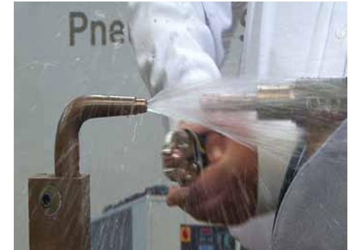
WRA250 not in use

Water connection available in NPT or BSPP