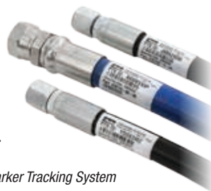
Parker Tracking System

See more Parker innovations on the Engineered Solutions pages.