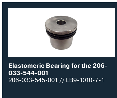
Elastomeric Bearing for the 206-033-544-001 206-033-545-001 // LB9-1010-7-1