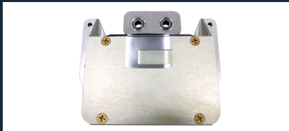
Isolation Mount (Kalfex Mod) 206-030-539-101 // LB9-1301-1-1VFM