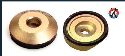
Stop Assembly (Upstop/Downstop) 206-033-518-005 // J-15424-2 206-033-518-007 // J-15425-2