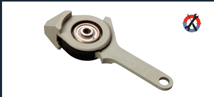
Arm, Flap Restraint 206-011-139-001 // J-14258-3