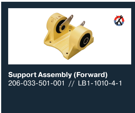
Support Assembly (Forward) 206-033-501-001 // LB1-1010-4-1