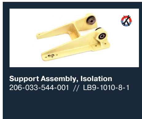
Support Assembly, Isolation 206-033-544-001 // LB9-1010-8-1