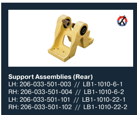
Support Assemblies (Rear) LH: 206-033-501-003 // LB1-1010-6-1 RH: 206-033-501-004 // LB1-1010-6-2 LH: 206-033-501-101 // LB1-1010-22-1 RH: 206-033-501-102 // LB1-1010-22-2