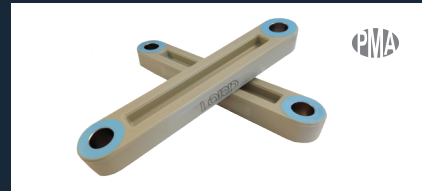
Tension Torsion Straps 206-310-004-101 // LORD206-310-004101 206-310-004-103 // LORD206-310-004103