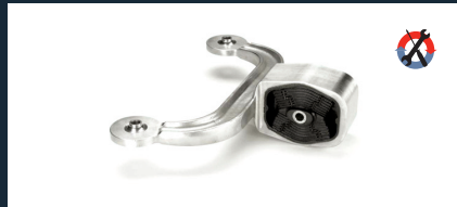
Restraint, Transmission 206-033-506-101 // J-15413-17 206-033-506-107 // J-15413-20 206-033-506-109 // J-15413-21