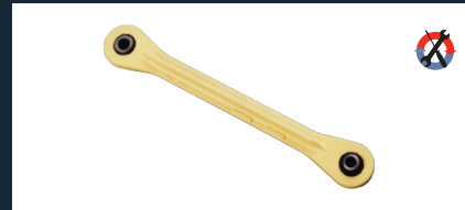
Link Assembly (Pylon) 206-033-554-101 // LB6-1010-16-1