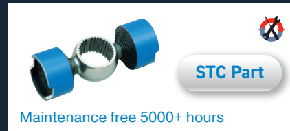
Elastomeric TR Trunnion Kit 206-011-812-005 // LB2-1010-20-1 (For first-time installation)

(replaces: one 206-011-812-005, two B-2012, two 53642-75, two 206-411-814-003, two 206-011-862-001)