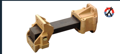
Flexure Assembly, Nodal Beam 206-033-516-101 // LB9-1010-1-2