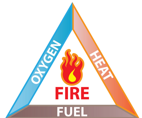
The “fire triangle” shows the three elements needed for a fire to occur: oxygen, heat and a fuel source.

Also important to note are the safety aspects of chemical blanketing. The technique holds the greatest safety sway in industries that use combustible, flammable or explosive materials. Blanketing prevents the materials from coming into contact with the oxygen in the air, and thereby creates a nonflammable environment. The explanation of this effect is simple. A fire requires three elements (often depicted with the common “fire triangle” illustration): fuel, oxygen and an ignition source such as static electricity or a spark. All it takes to eliminate the possibility of fire is to remove one of the elements. In considering the fire triangle, note that even when chemical storage tanks are electrically grounded, static changes can always occur. And the very material the tank holds can itself act as a fuel.