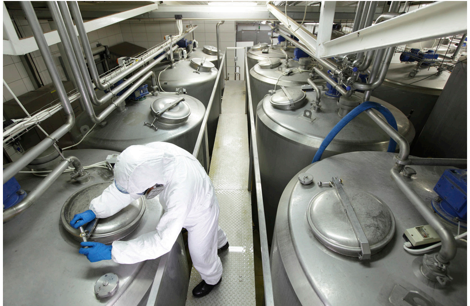
Large tanks such as these are used to store chemicals such as methanol, acetone and benzene and foodstuffs like wine and edible oils.

Process control managers often overlook the potential for chemical tank blanketing to improve facility productivity and safety. In tank blanketing, a low-pressure flow of nitrogen gas (typically less than a few psig) with purities of between 95% to 99.9% is introduced above the liquid level of the chemical to fill the vapor space at the top of the tank with a dry, inert gas. On closed tanks, this creates a slight positive pressure in the tank. Nitrogen is the most commonly used gas because it is widely available and relatively inexpensive, but other gases such as carbon dioxide or argon are sometimes employed. However, carbon dioxide is more reactive than nitrogen and argon is about ten times more expensive.