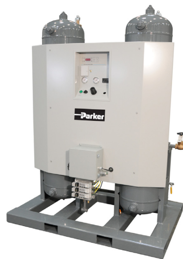
Pressure Swing Adsorption (PSA) nitrogen generators use a Carbon Molecular Sieve (CMS) material inside a vessel that contains pressurized air to draw off the nitrogen molecules.

As an example of how membrane nitrogen generators work, the Parker Balston membrane nitrogen generators use a proprietary hollow fiber membrane technology that separates the compressed air into two streams. One stream is 95% to 99% or higher pure nitrogen while the other stream contains the separated oxygen, carbon dioxide, water vapor and other gases. The generator separates the compressed air into component gasses by passing the air through semipermeable membranes consisting of bundles of hollow fibers.