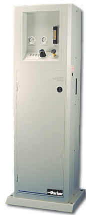
Membrane nitrogen generators use a separation technology made up of polymer fibers that act like a membrane.

liquid nitrogen are typically between 3000 gallon and 11,000 gallon in size. The cost of nitrogen to the end user depends on so-called "vaporization units" that relate to how much of the gas a company purchases annually. As of this writing, gas costs range from $0.30 to $0.70 per 100 cubic feet. Dewars are high-pressure tanks that hold between 3600 cubic feet to 4000 cubic feet of gas. The average cost to the user here is $0.80 to $0.90 per 100 cubic foot.