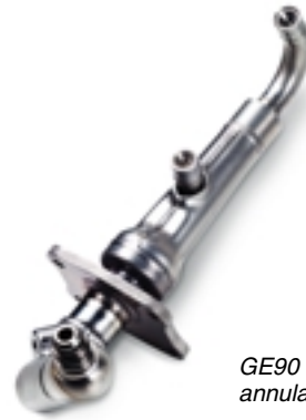
GE90 dual annular