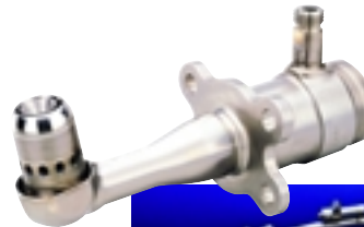
F414 nozzle with after- burner spray- bars and manifold