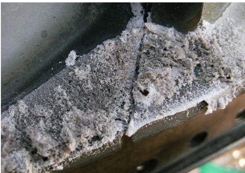
Fig. 3. Inadequate gas turbine air intake filtration – sodium sulfate ( \text{Na}_2\text{SO}_4 ) buildup on power turbine blades and vanes.

The TS1000 is a technology from Parker which uses a mesh designed to deliberately allow dust and sand to pass through while coalescing free moisture. This leaves the final filters to deal with the relatively dry dust and sand; something they are perfectly well designed to handle.