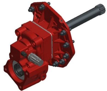
Figure 1 – 524 Series PTO w/ "DD" input