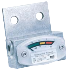
KBDPG-15 Differential Pressure Gauge Kit Temp: 200°F (93°C) Pressure: 250 PSIG (17 bar) (Kit includes 1/8" and 1/4" NPT brass fittings, flexible nylon tubing and mounting bracket)