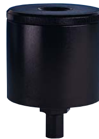
MS-50 Metal Sump Drain (External) Temp: 175°F (79°C) Pressure: 250 PSIG (17 bar) 1/8" NPT Drain Connection 1/2" NPT Inlet Connection