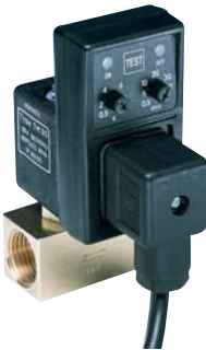
TV-25 Timed Drain Valve Temp: 230°F (110°C) Pressure: 300 PSIG (20 bar) 1/4" NPT