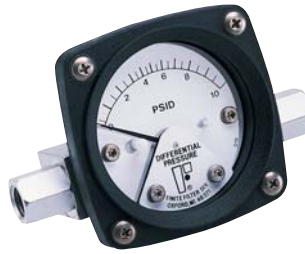
DPI-25 Differential Pressure Gauge Temp: 200°F (88°C) Pressure: 5000 PSIG (340 bar) 1/4" NPT Connections