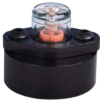
DPI-13 Differential Pressure Indicator Temp: 175°F (79°C) Pressure: 250 PSIG (17 bar) 1/8" NPT Connections