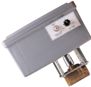
TD-50 Adjustable Timed Drain Valve Temp: 150°F (66°C) Pressure: 600 PSIG (42 bar) 1/2" NPT Inlet and Outlet Connections