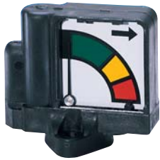
DPG-15 Differential Pressure Gauge Temp: 175°F (79°C) Pressure: 500 PSIG (34 bar) (Fits on pre-drilled H-Series housings only)