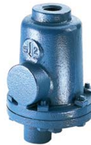
ADT-50 Float Actuated Drain Trap Temp: 450°F (232°C) Pressure: 150 PSIG (10 bar) 1/2" NPT Inlet Connection 1/4" NPT Drain Connection