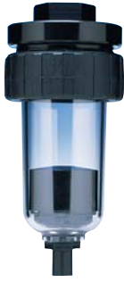
VS-50 Visual Sump Drain Temp: 125°F (52°C) Pressure: 150 PSIG (10 bar)