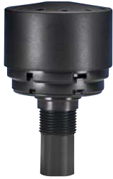
AD-12 Automatic Drain Valve (Internal) Temp: 175°F (79°C) Pressure: 250 PSIG (17 bar) 1/8" NPT Drain Connection

A comprehensive guide to products that compliment your filtration requirements