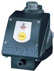
ZLD-10 Zero Loss Drain Temp: 35°-140°F (2°-60°C) Pressure: 12-250 PSIG (0-17 bar)