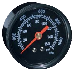
P781641, P781642 Pressure Gauges Temp: 125°F (52°C) Pressure: 0-60 PSIG (0-4 bar), 0-160 PSIG (0-11 bar)