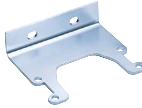
BK-1, BK-3 Mounting Brackets