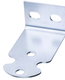
MBS-1 Stainless Steel Mounting Bracket