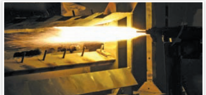
Robotic flame spray booth

"We are also very proud that in taking this step we continue to be a very green operation. Right now, and for several years, we have not had a hazardous waste stream. Everything we do in our operation is recycled."