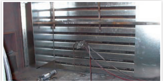
Slotted inlet source capture collection hoods provide uniform exhaust air flow.