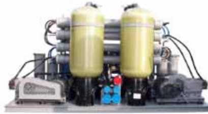
SW Series (back side view)

a single skid with two complete, independent RO systems. The two trains can run together or can be operated on a duty/stand by basis. Top quality components, manufactured by Parker Village Marine, provide maximum corrosion resistance. Straight-forward, easy to understand controls, result in reliable operation.