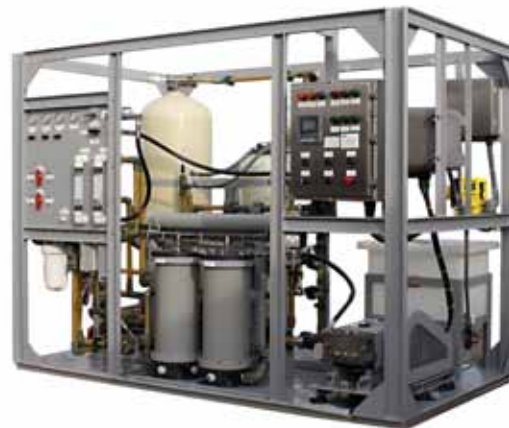
Parker Village Marine CC-2000 XP

2,000-26,000 GPD (7,500-100,000 LPD) For Offshore FPSO, FSO, MODU and Drillships