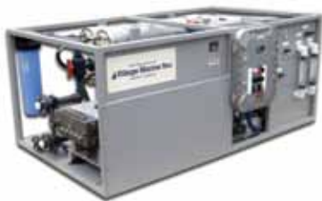
Parker Village Marine PW-8000 XP Explosion Proof (See bulletin no. 7857)

The Pure Water (PW) Series is designed to provide installation flexibility, superior performance, and extended service life in the most rugged conditions. PW units are typically installed in 24/7, continuous-duty applications. Each features a 3 or 5 plunger titanium pump for low vibration and low noise with unsurpassed corrosion resistance.