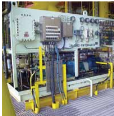
Parker Village Marine CC-10000 XP

The CC Series provides custom engineered solutions to meet customer specifications. Each one is configured with all accessories in a single box frame. The core of the system uses the proven AquaPro ® titanium pressure pumps and membranes.