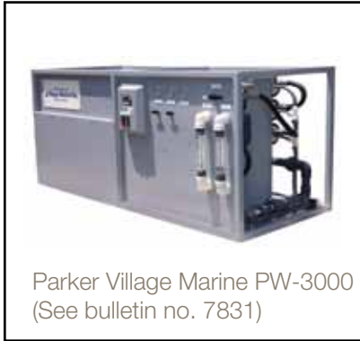
Parker Village Marine PW-3000 (See bulletin no. 7831)

The Pure Water (PW) Series is designed to provide installation flexibility, superior performance, and extended service life in the most rugged conditions. PW units are typically installed in 24/7, continuous-duty applications. Each features a 3 or 5 plunger titanium pump for low vibration and low noise with unsurpassed corrosion resistance.