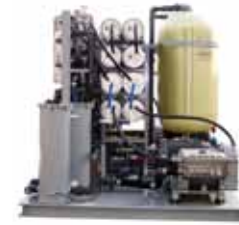
SW Series (right side view)