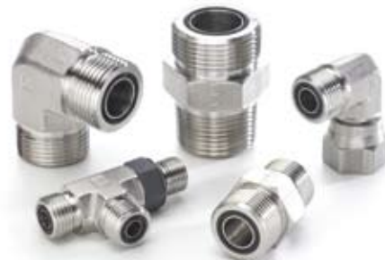
Seal-Lok™ O-Ring Face Seal Tube Fittings

So don't think twice when you need stainless. Call your Parker distributor, or 1-800-CPARKER , and you'll see why we're your best choice in the business.