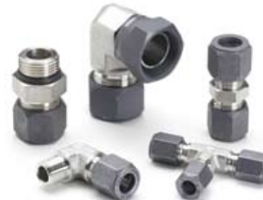
Ferulok® Flareless Bite Type Fittings

Sizes ..... 1/4" through 2" Pressures ..... Up to 9200 psi