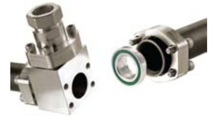
Parflange® F37 System Non-Welded Tube and Pipe SAE Flange System

Sizes ..... 1/8" through 2" Pressures ..... Up to 6000 psi