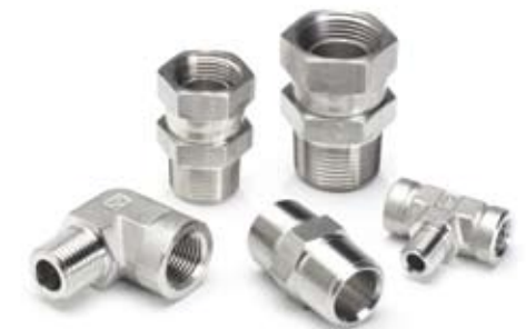
Pipe Fittings and Pipe Swivels

Sizes ..... 4 mm through 42 mm Pressures ..... Up to 630 bar/9200 psi