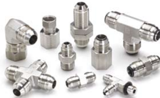
Triple-Lok® and Triple-Lok® 2 37° Flare Tube Fittings and Adapters

Sizes ..... Tube O.D. up to 5.5" Pressures ..... Up to 6000 psi