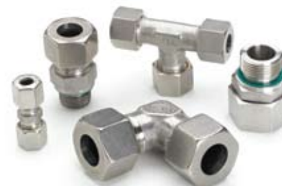
E0 and E0-2 Metric Bite Type Fittings

Triple-Lok Sizes ..... 1/8" through 2" Triple-Lok 2 Sizes ..... 1/4" through 2" Pressures ..... Up to 9000 psi