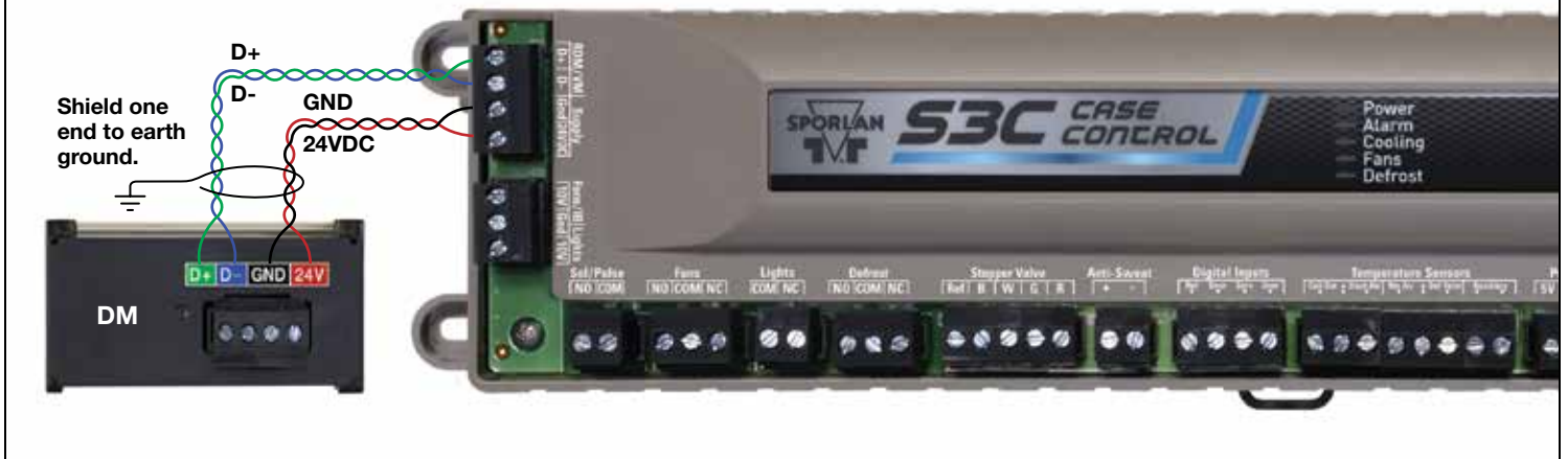
Figure 3 - Wiring Diagram

Diagram for reference only. Refer to input/output electrical ratings for all external connections. For safety information, see the Safety Guide at www.parker.com/safety or call 1-800-CPARKER.