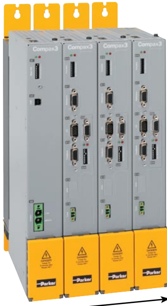
10kW supply with three M150D6 axis units = 7.87"