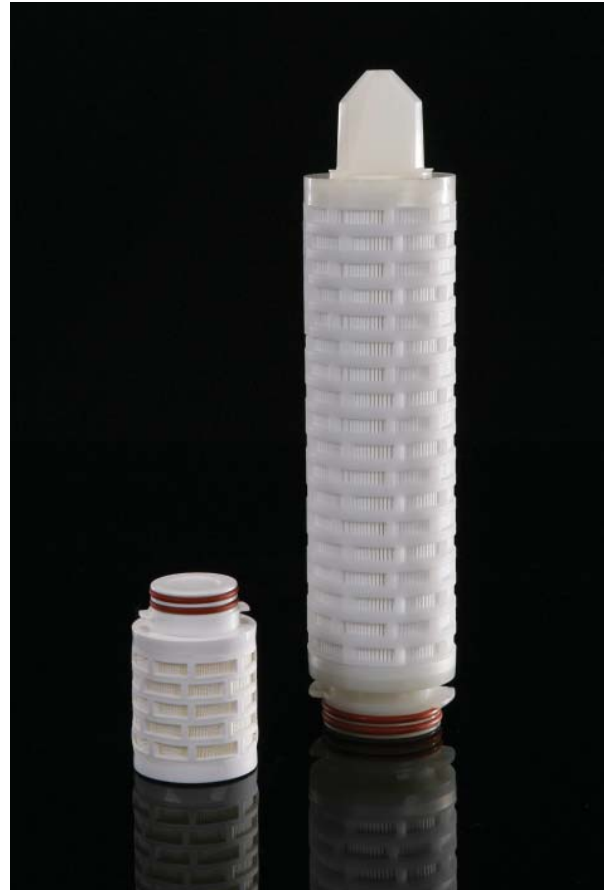
Note: BIO-X is a registered trademark of Parker domnick hunter