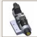
Electric non-proportional control