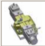
Electric proportional control with hydraulic override and feedback