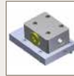
Hydraulic displacement control without feedback