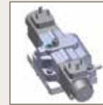
Electric proportional control with feedback