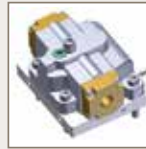
Hydraulic displacement control with feedback