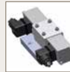
Electric proportional control without feedback

The C055 accommodates a wide range of controls designed to meet unique applications needs. All C Series electronic controllers are compatible with the IQAN family of controllers for ease in integrating into mobile control applications.