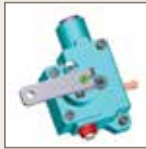
Manual displacement control