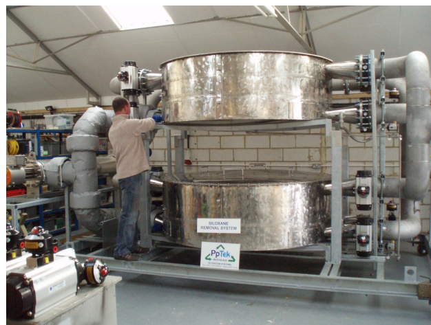
Photograph of a BioGas AKC being commissioned at PpTek Factory.