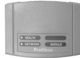
PROFIBUS Module 6513/PROF/00

The Profibus interface enables the drive to connect to a Profibus-DP as a slave station.