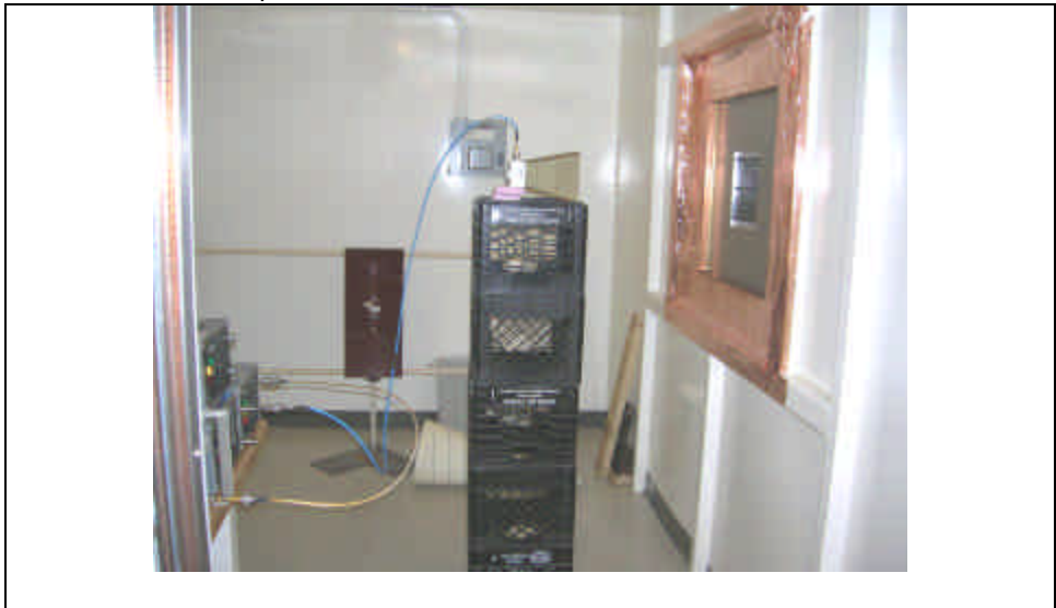
Photograph Description: Test set-up of transmit side of test fixture using Horn antenna. FORM CTS-PHOTO

DATE: 02/14/06 TEST NUMBER: ONE (1) COUPLING DEVICE: HORN ANTENNA TEST SPEC: IEEE-STD-299