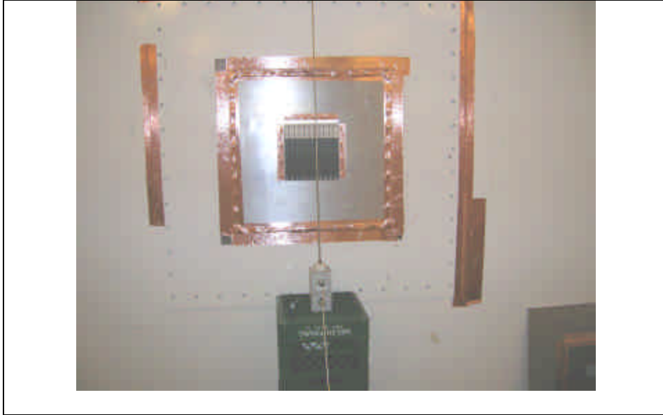
Photograph Description: Test set-up using the Passive Rod antenna 500kHz to 20MHz. FORM CTS-PHOTO