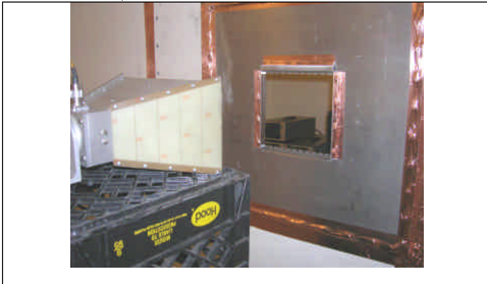
Photograph Description: Open reference test setup with Horn antenna 1GHz to 18GHz. FORM CTS-PHOTO

DATE: 02/14/06 TEST NUMBER: ONE (1) COUPLING DEVICE: HORN ANTENNA TEST SPEC: IEEE-STD-299