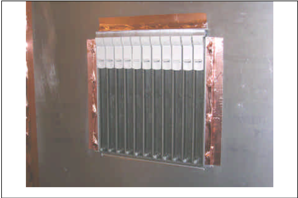
Photograph Description: Test set-up with Face Plates installed in test fixture. FORM CTS-PHOTO

DATE: 02/14/06 TEST NUMBER: ONE (1) COUPLING DEVICE: N/A TEST SPEC: IEEE-STD-299