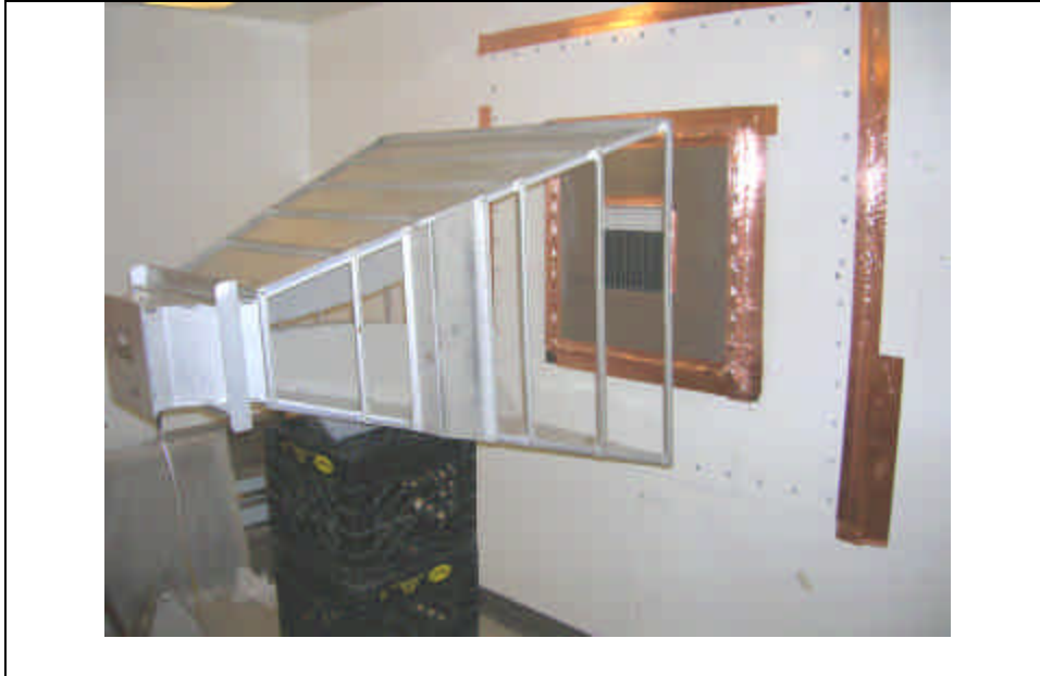
Photograph Description: Open reference test setup with Horn antenna 200MHz to 1GHz. FORM CTS-PHOTO

DATE: 02/14/06 TEST NUMBER: ONE (1) COUPLING DEVICE: HORN ANTENNA TEST SPEC: IEEE-STD-299