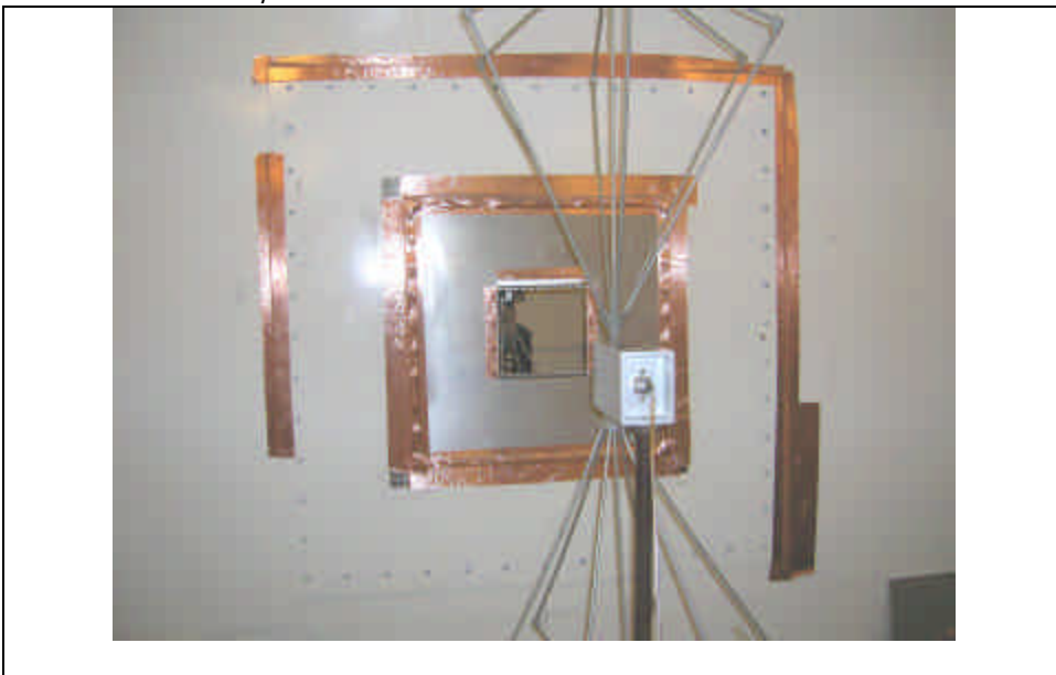
Photograph Description: Open reference test setup with Biconical antenna 20MHz to 1GHz. FORM CTS-PHOTO