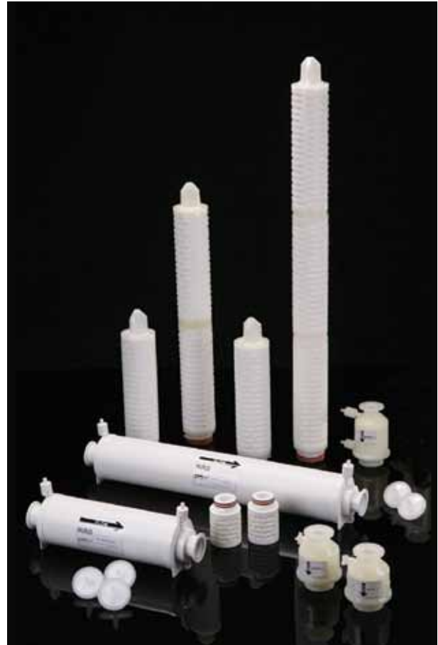
Note: TETPOR is a registered trademark of Parker domnick hunter