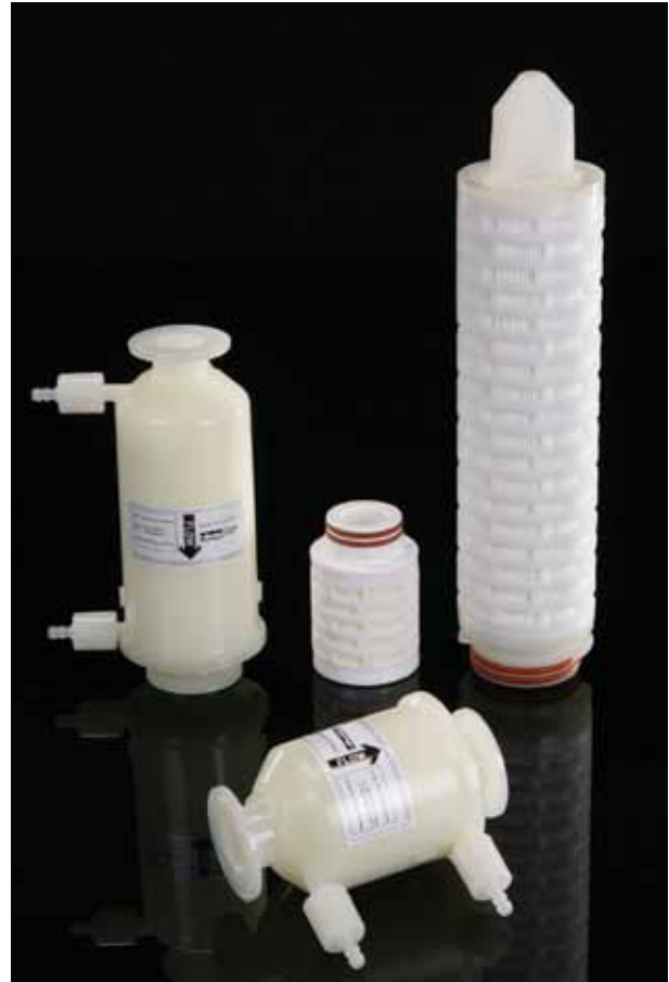
Note: PREPOR is a registered trademark of Parker domnick hunter