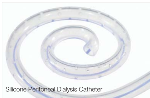
Silicone Peritoneal Dialysis Catheter