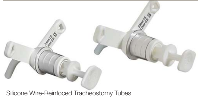
Silicone Wire-Reinforced Tracheostomy Tubes