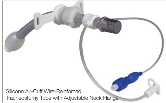
Silicone Air-Cuff Wire-Reinforced Tracheostomy Tube with Adjustable Neck Flange