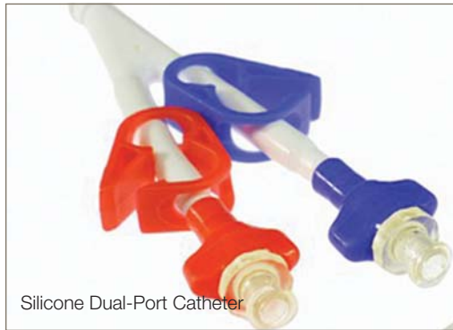
Silicone Dual-Port Catheter

Parker's Medical System Division manufactures single-use as well as short & long-term implantable silicone medical devices in an ISO 13485, FDA registered facility with ISO Class 7 and ISO Class 8 Cleanrooms.